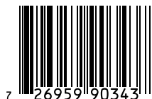
Bob's '47 Sixth-Bbl