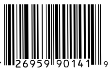
Bob's '47 Bottle