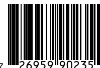
Double-Wide I.P.A. 750ml Bottle