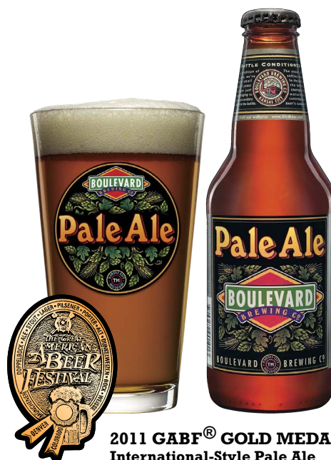
2011 GABF® GOLD MEDAL International-Style Pale Ale