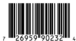
7 26959 90232 4 Tank 7 4-pack

Sauce-based dishes, herb-roasted chicken, pork or fish. Mushrooms, mushroom sauces. Soft or semi-soft washed-rind cheeses like Taleggio