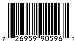
7 26959 90596 7 Tank 7 12-oz Bottle