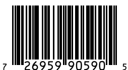
7 26959 90590 5 Tank 7 750ml Bottle