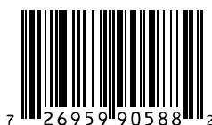
7 26959 90588 2 Tank 7 Farmhouse Ale Sixth-Bbl