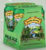
4-Pack (16 oz. Can)