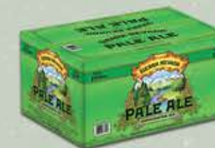
Loose Pack (12 oz. Bottle)