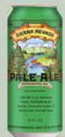
16 oz. Can