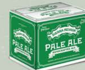
Shipper Case (24 oz. Bottle)