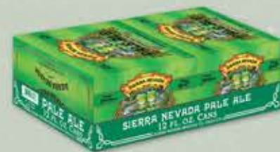
2 x 12-Pack Tray (12 oz. Can)