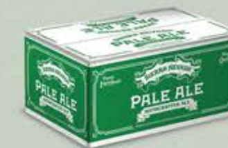
Shipper Case (12 oz. Bottle)