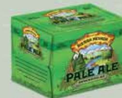
12-Pack (12 oz. Bottle)