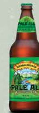
24 oz. Bottle