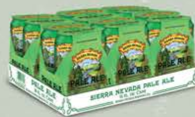
6 x 4-Pack Tray (16 oz. Can)