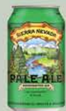
12 oz. Can

Yeast: Ale yeast Bittering Hops: Magnum, Perle Finishing Hops: Cascade Malts: Two-row Pale, Caramel