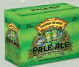
12-Pack (12 oz. Can)